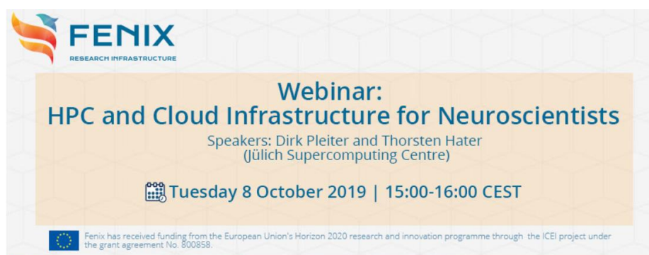
Figure 4: Promotional banner for the 1st Fenix webinar

This webinar was held on 8 October 2019. It offered an overview of ICEI/Fenix and introduced the services and available resources of the Fenix infrastructure. It also provided information for interested users on how to get access and further details on how to use the data repositories that are available in ICEI. The target audiences of this webinar were HPC infrastructure users and neuroscientists.