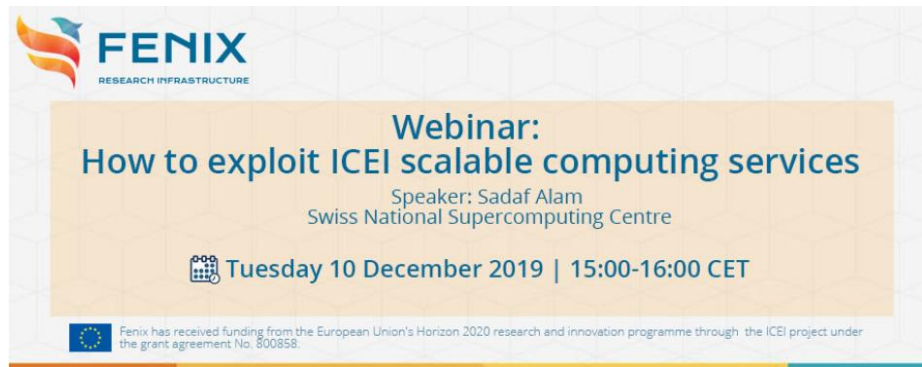
Figure 5: Promotional banner for the 2nd Fenix webinar

This webinar took place on 10 December 2019. The goal of this webinar was to introduce participants to the Fenix Scalable Computing Services (SCC). It also provided details on the ICEI infrastructure for SCC at the Swiss National Supercomputing Computing Centre (CSCS). This webinar was targeted to HPC infrastructure users, neuroscientists, application and platform developers and workflow engineers.