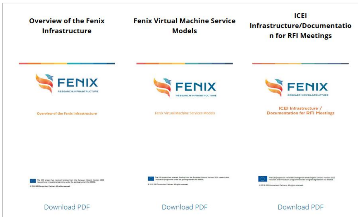
Figure 1: Fenix technical documents