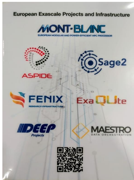
Figure 7: Microfiber cloth with project logos for the ISC 2019 joint booth

Similarly, Fenix participated in the SC 2019 conference with a shared booth along with European Exascale projects: Aspide , EVOLVE , ExaQUte , LEXIS , MAESTRO , and Mont-Blanc 2020 . Fenix offered two prizes (a media pad and a smart watch) at the draws organised at the booth.