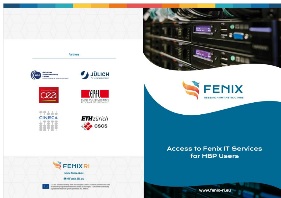
Figure 2: Fenix flyer for HBP users (front and back page)

Around 1000 copies of this flyer has been printed out and distributed so far. Furthermore, there have been 341 clicks on this flyer on the Fenix website during the period M1 to M24.