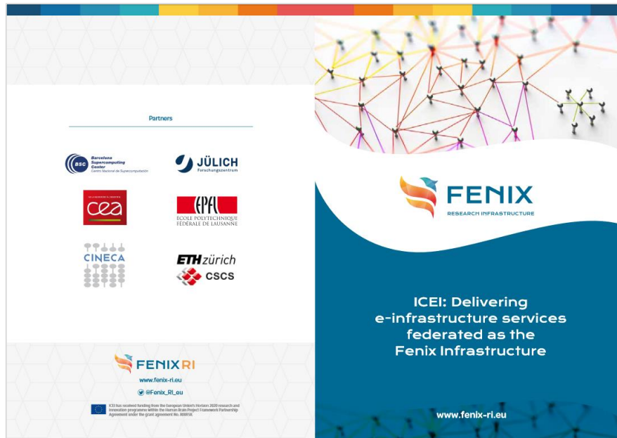
Figure 6: Fenix generic flyer (front and back page)

Around 1000 copies of this flyer has been printed out and distributed so far. Furthermore, there have been 252 clicks on this flyer on the Fenix website during the period M1 to M24.