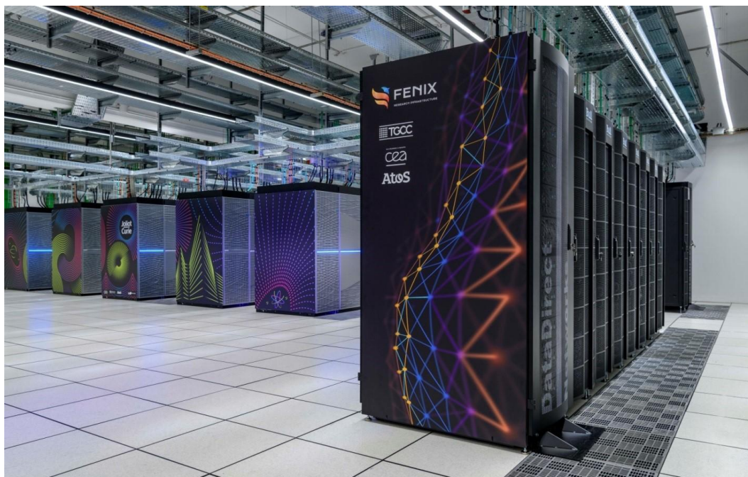
Figure 3 - Fenix systems at CEA

Delivery took place in the first half of 2020 and systems were made available in July 2020 (with some delays due to COVID-related measures).