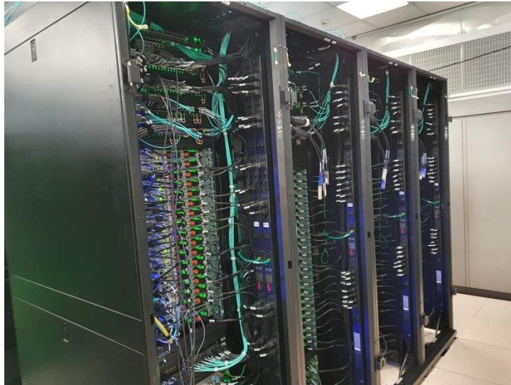
Figure 5 - Fenix systems at CINECA