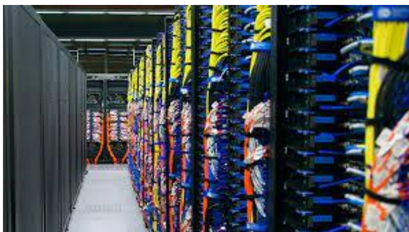
Figure 4 - Nord3 compute racks at BSC

The contract for lot 1 was awarded later, in December 2020, and the corresponding hardware was delivered and installed starting in January 2021 and was opened to first users on June 2021.