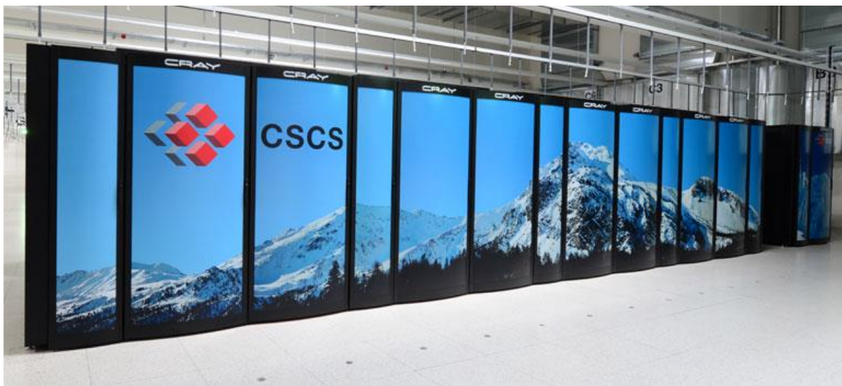
Figure 1 - The Piz Daint supercomputer at CSCS

Thanks to a forward planning ETHZ/CSCS was able to provide all co-financed resources from April 2018. Available resources on the Piz Daint supercomputer made it possible to provide scalable computing services to HBP and PRACE from the very beginning of ICEI project. Once the ICEI project was approved, ETHZ/CSCS procured the necessary additional scalable and interactive computing resources. These resources were installed and made available in the mid-September 2018.